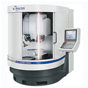
TOP LEVEL PRODUCTION WITH WALTER