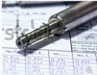
TOP LEVEL DESIGN WITH SOLIDWORKS