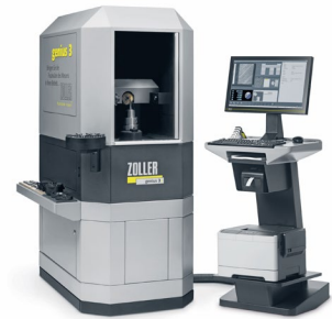
TOP LEVEL INSPECTION WITH ZOLLER